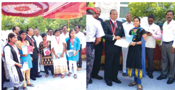
Independence Day Celebration 2017 - Prize Winners in Dance Competition & English Elocution.

Prize Winners in various events including "Best Budding Journalist", "Best Radio Jockey" for 3 consecutive years at the "Karisal" - South Indian Inter Media departmental Festival organized by the Department of Communication, Manonmaniam Sundaranar University, Thirunelveli