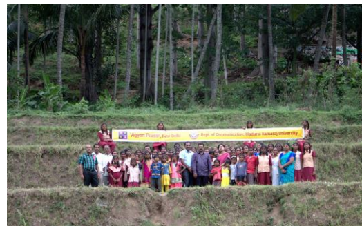
Two day Capacity Building Workshop on Adolescent Health for Tribal Girls in Kurangani/Kottakudi, Theni Dt.