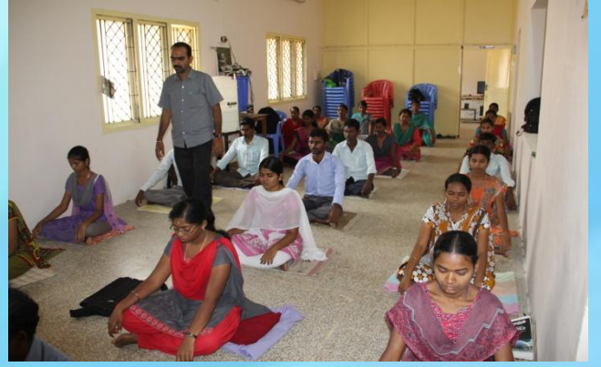
SSS Course Yoga Class – An excerpt