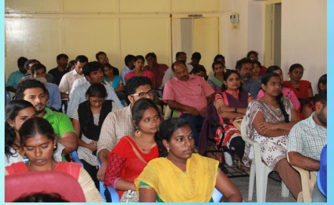
Ph.D. Public Viva-voce – A view of audience