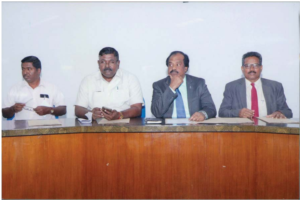
Honorable Vice-Chancellor and Other Officials of Madurai Kamaraj University participating in the deliberation about NAD in Principals' Meeting on 10<sup>th</sup> November 2018