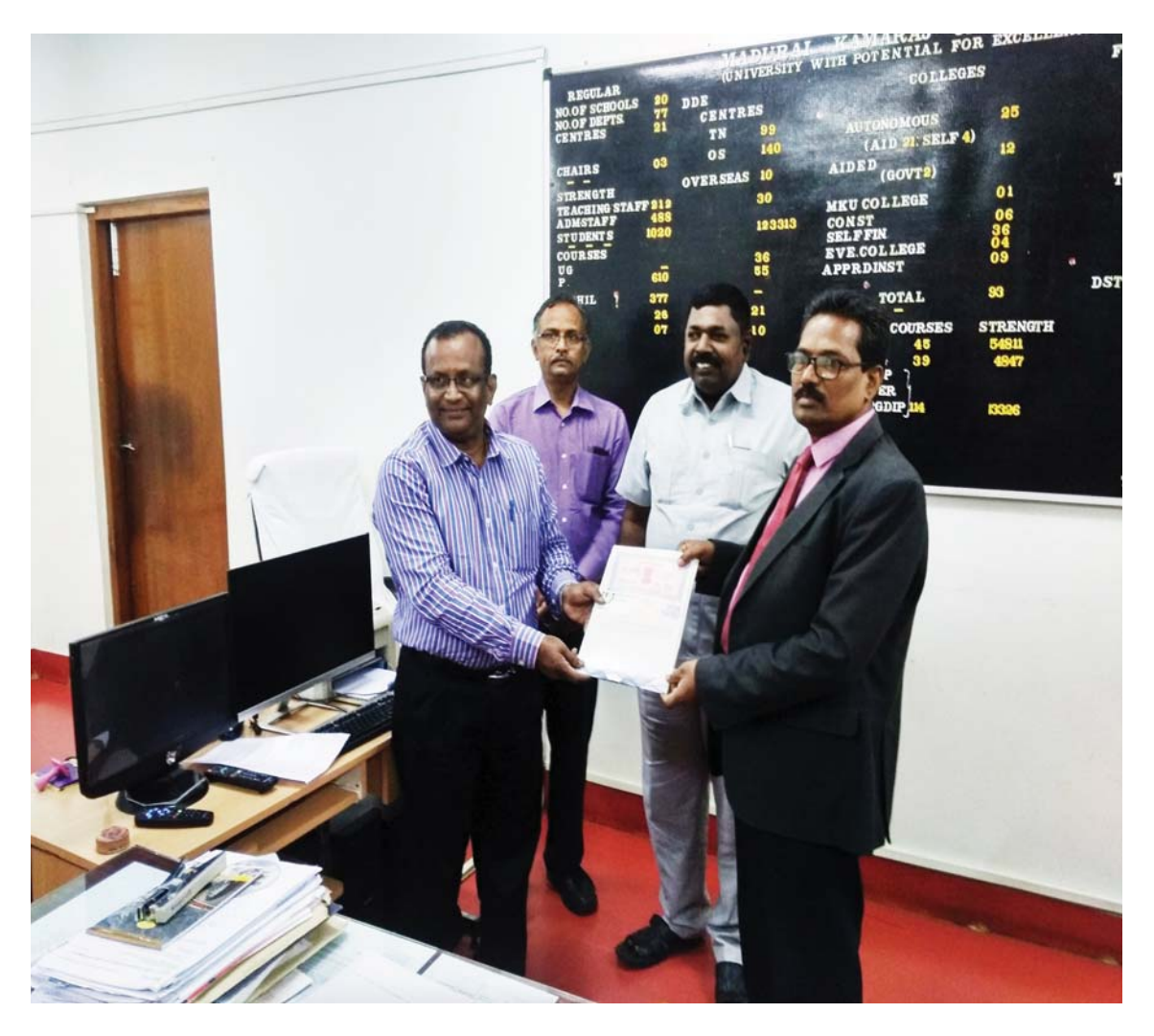
MOU signing ceremony on 9<sup>th</sup> July, 2018