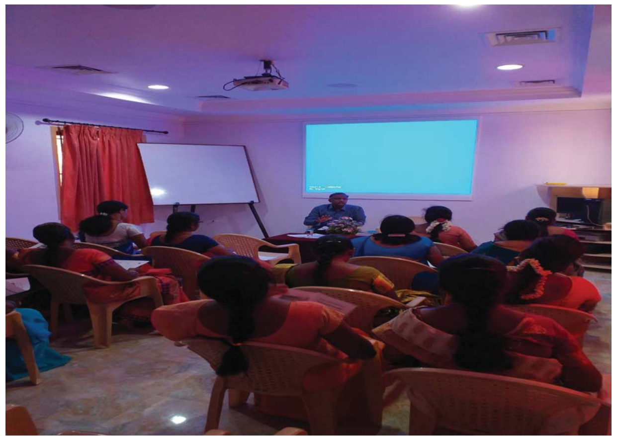
MKU NAD Cell organized NAD awareness meeting for the Heads of various Departments at Fatima college, Madurai on 20th Feb 2019