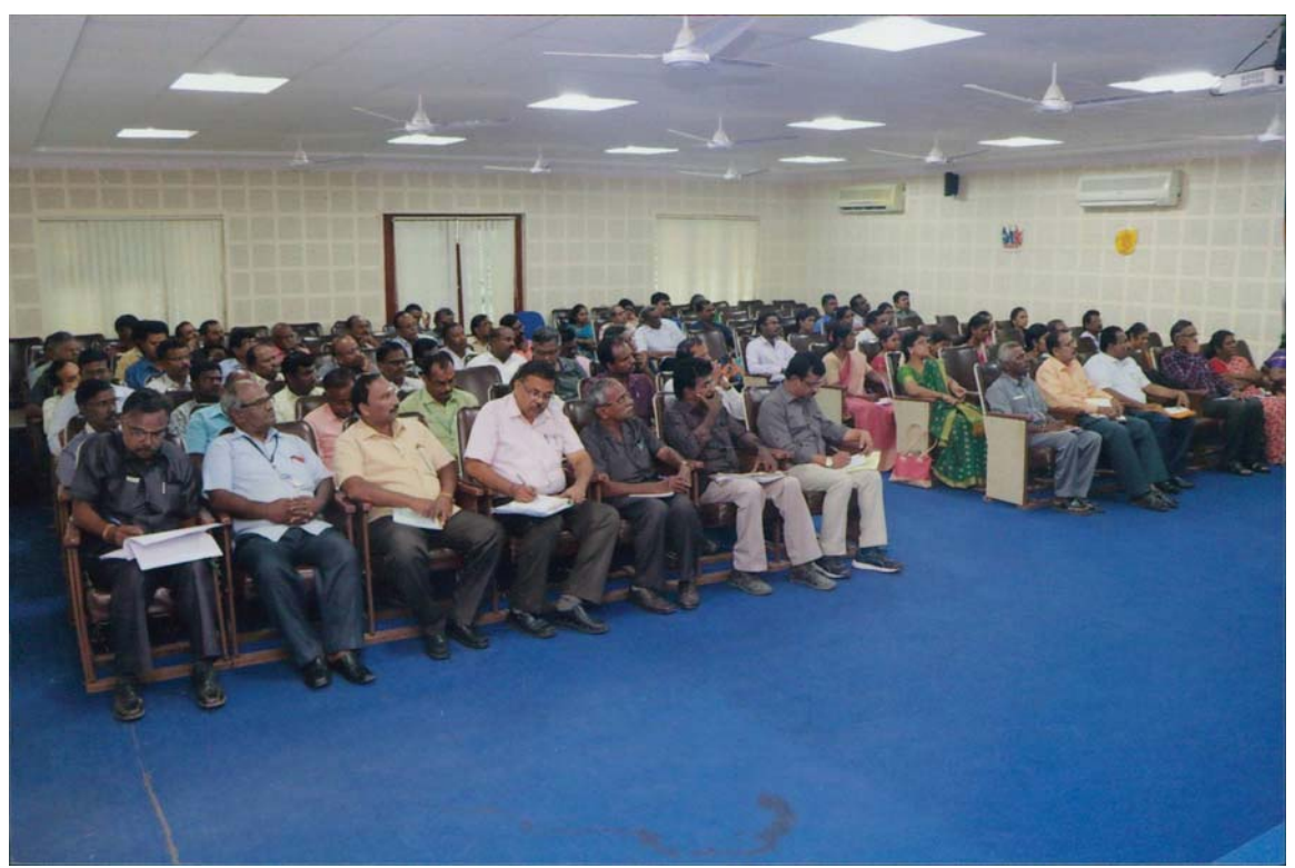
A section of the attendees in the deliberation about NAD in Principals' Meeting on 10^{\text{th}} November 2018