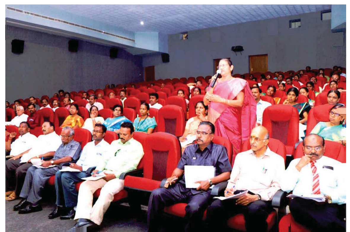
A section of the attendees during the deliberation on NAD at Affiliated Colleges Principals' Meeting on 10<sup>th</sup> Semptember 2018