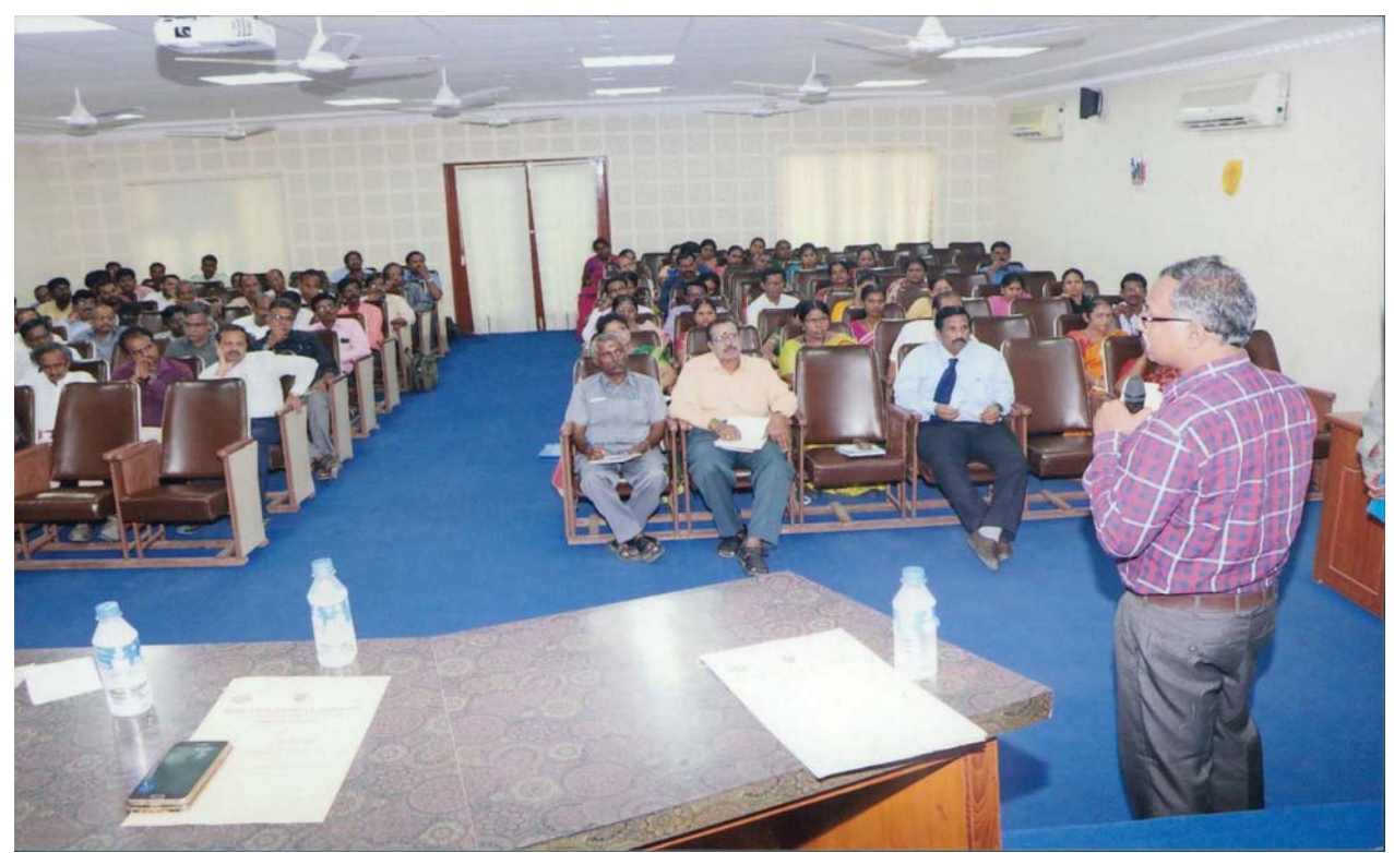
MKU NAD Nodal Officer is speaking in the deliberation about NAD at Affiliated College Principals' Meeting held on 10<sup>th</sup> November 2018