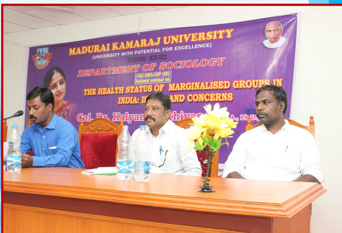
School of social sciences