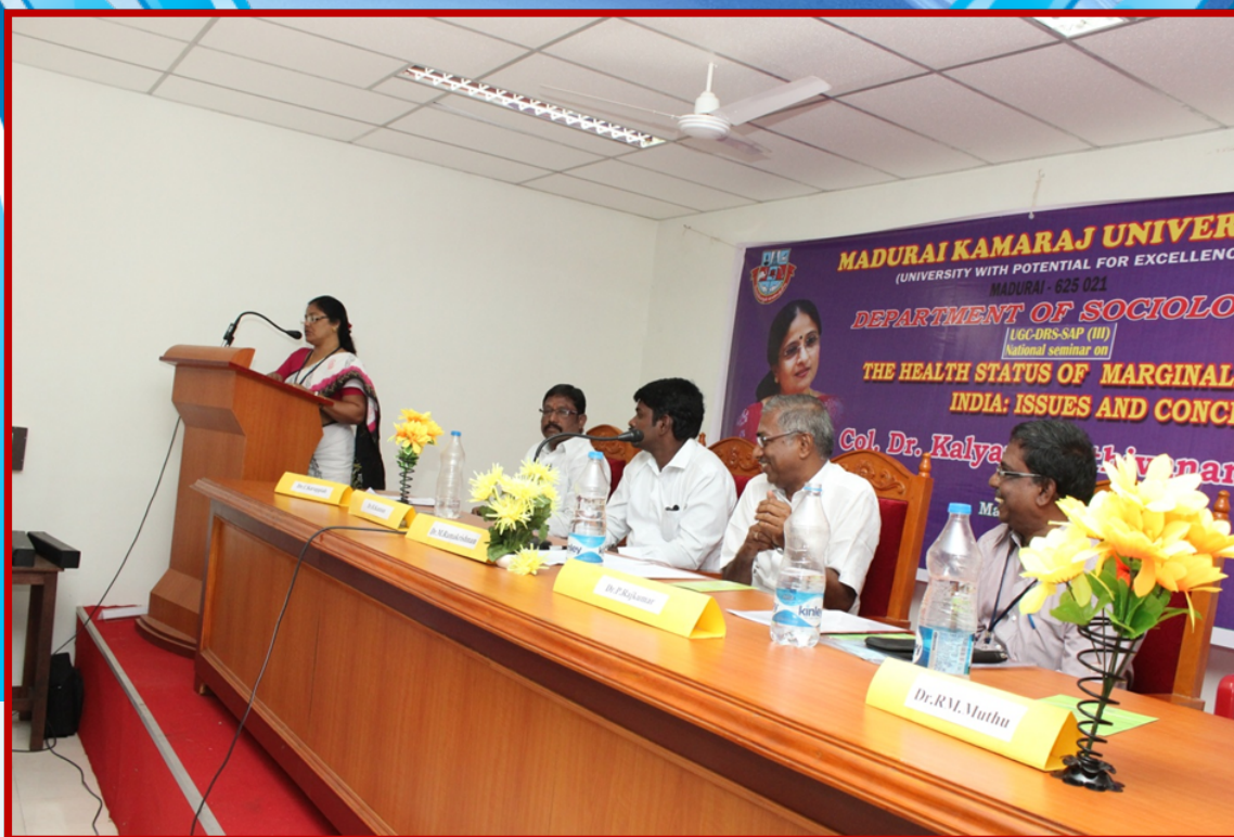
Paper presentation session in national seminar