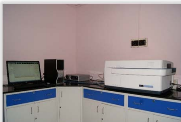
High Content Screening