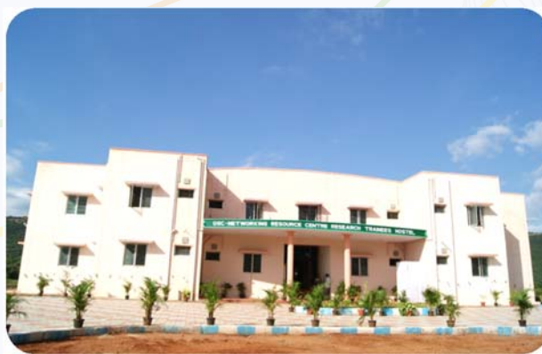
NRCBS Research Trainees Hostel

UGC-NRCBS at MKU is serving as the resource centre for collaborative research and training for faculty, scientists and research students of other Universities, Colleges and Institutions, with state of the art infrastructural facilities. UGC has sanctioned Rupees 10 Crores to implement the activities of UGC-Networking Resource Centre in Biological Sciences (UGC-NRCBS) at School of Biological Sciences, Madurai Kamaraj University. The centre was officially commissioned on 10-10-2008 at School of Biological Sciences, Madurai Kamaraj University. The above programme has been further extended and UGC has sanctioned another Rs.10 Crores as NRCBS-Phase II for next five years (2017-2022).