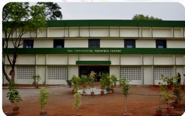
Networking Resource Centre in Biological Sciences